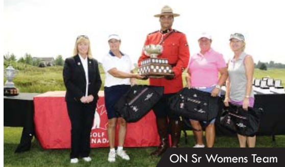
ON Sr Womens Team