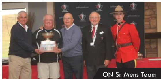
ON Sr Mens Team